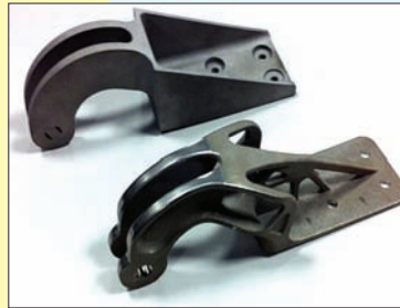
LIGHTER LOAD: A CONVENTIONAL HINSE FOR THE COVER OF A JET ENGINE (TOP) COULD BE REPLACED BY THE MORE INTRICATE ONE AT BOTTOM, WHICH IS JUST AS STRONG BUT WEIGHS HALF AS MUCH. THE NEW DESIGN, CREATED BY EADS, IS MADE PRACTICAL BY THREE-DIMENSIONAL PRINTING TECHNOLOGY.

for a range of its businesses, including those involving health care and aerospace. The company aims to take advantage of the technology's potential to make parts that are lighter, perform better, and cost less than parts made with conventional manufacturing techniques.